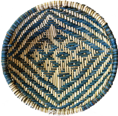
Tray with Handles